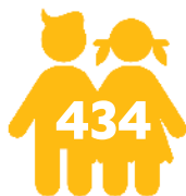
SAN LUIS MARACAIBO