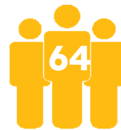
CARIBBEAN COAST COLOMBIA