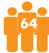
SAN LUIS VENEZUELA