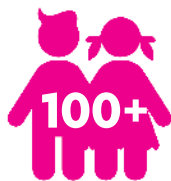
CARIBBEAN COAST COLOMBIA