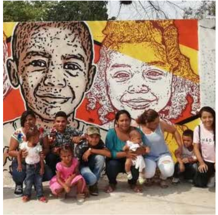
San Angel, Colombia