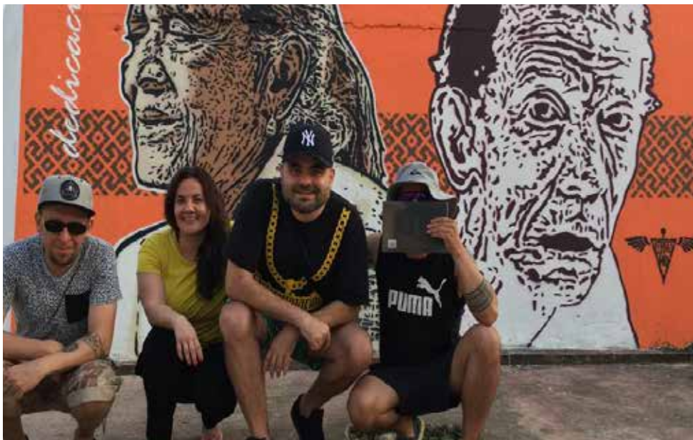
El Dificil, Colombia