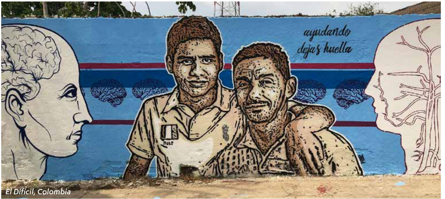
El Dificil, Colombia